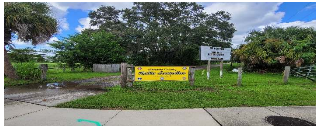
Old Gate Location