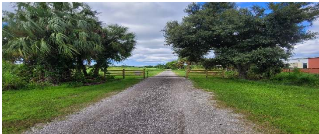
New Gate Location

A new field gate has been installed at the entrance to the MCRC field. The old field gate was removed due to land restrictions. A new field gate has been installed to secure the MCRC field for our members. There is a combination lock on the new fence gate with the same lock combination as before.